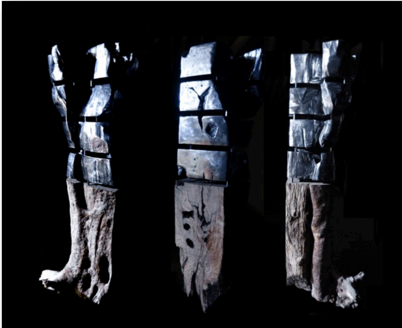
alumiernert 1, height 170cm, polished aluminum, olive wood, 2017 Carole Kohler works with augmented reality by ARTIVIVE Download the ARTIVIVE app and try with this sculpture