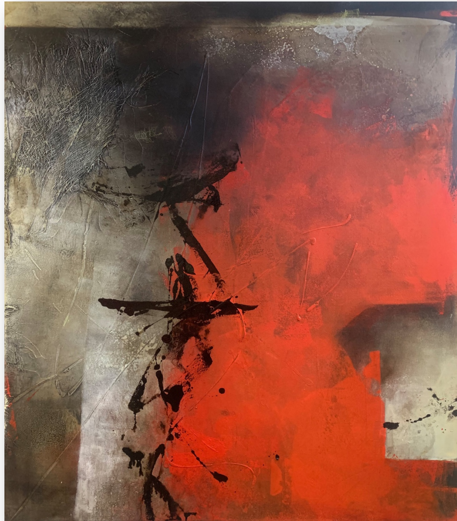
Koi, Signum Series, 140x120 cm, mixed media, 2020 Carole Kohler works with augmented reality by ARTIVIVE Download the ARTIVIVE app and try with this painting