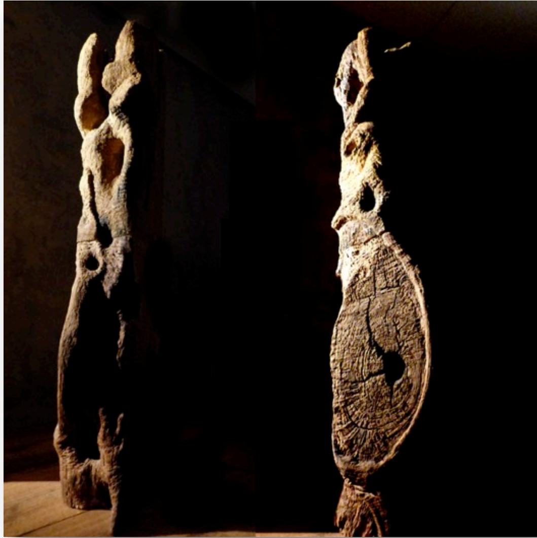
Prototyp, height 140cm, limestone, olive wood, 2015