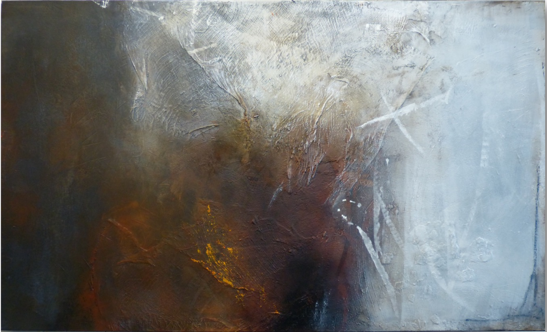
Indian Summer, Open Air Series, 90x150 cm, mixed media, 2018