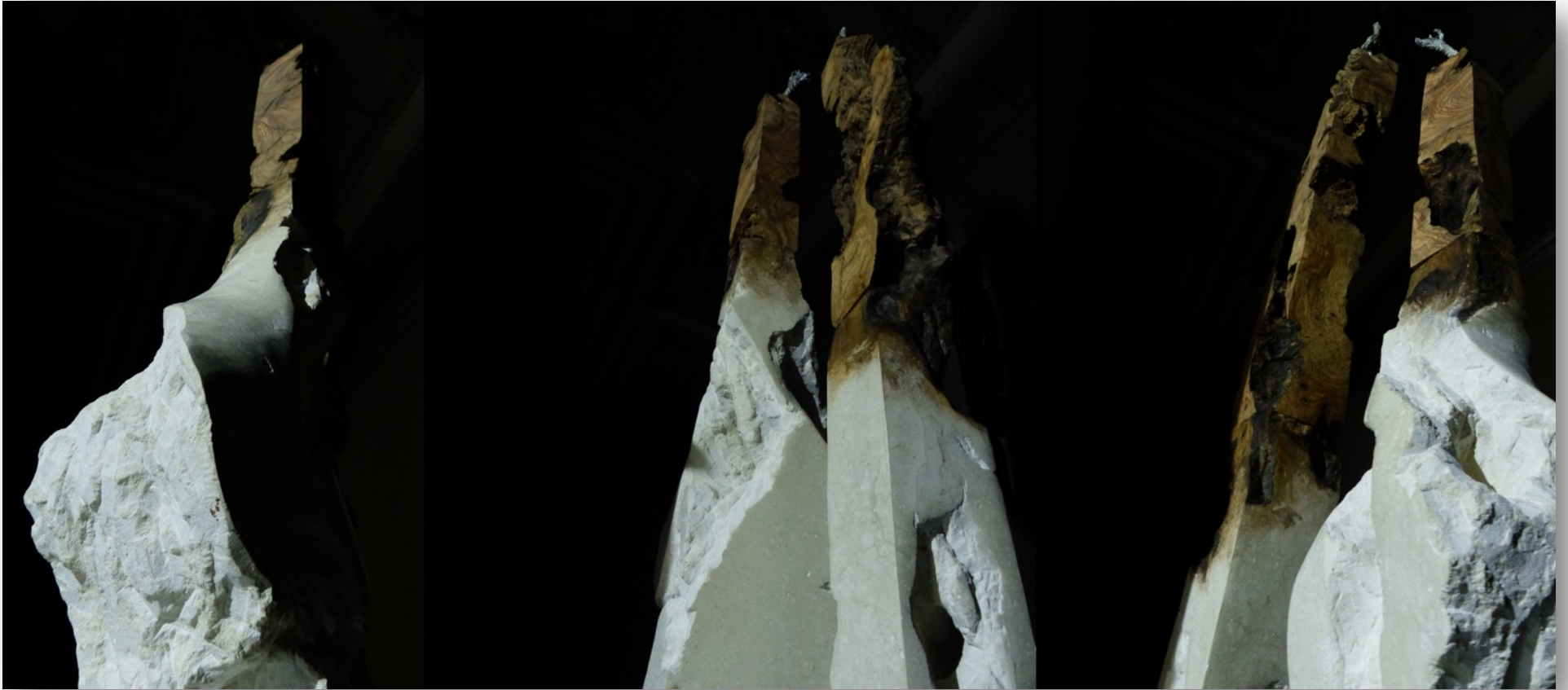
métamorphose, stone (pierre de Lens), olive wood, 45x30x140cm 2018