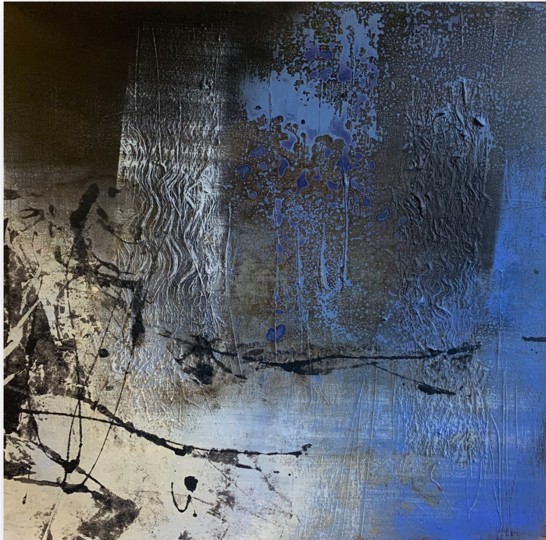
Splash, Nordic Feeling Series, 80x80 cm, mixed media, 2020