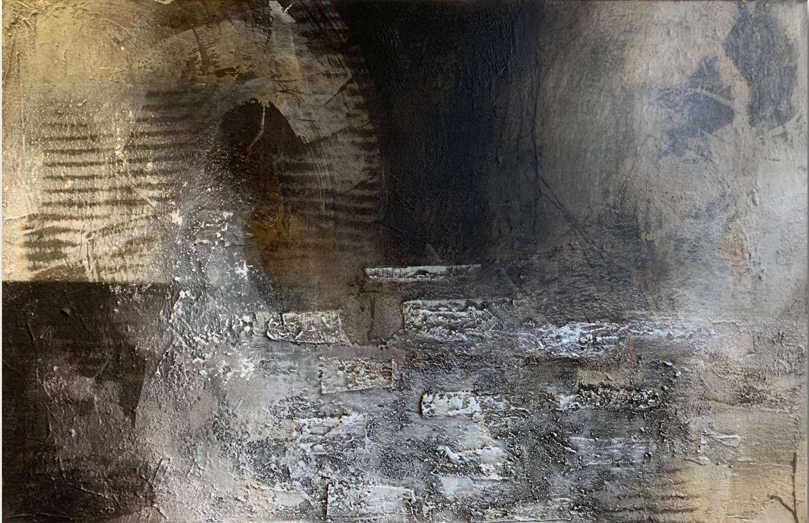
Eyez, Signum Series 90x140 cm, mixed media, 2020