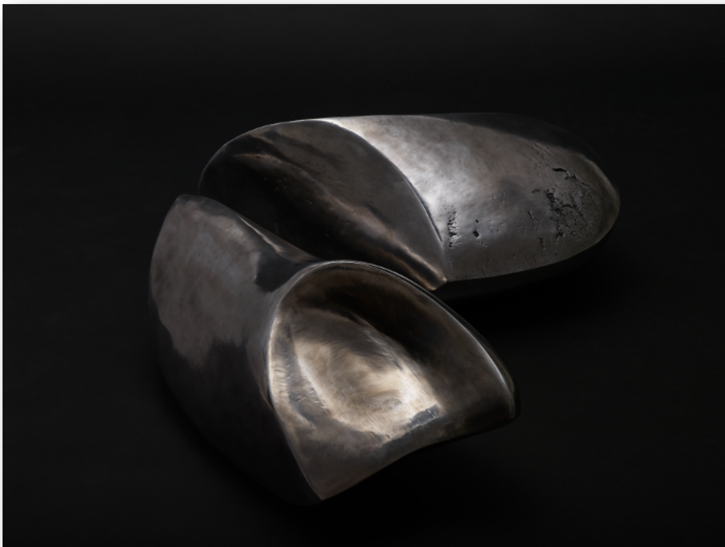
Pebbles, 60x40x30cm and 70x28x28cm, polished, solid aluminium, 2017